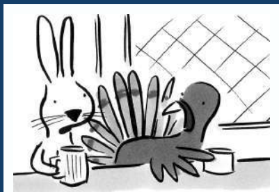
Take the groundhog - now that's a sweet gig."