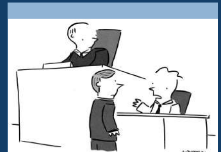
“I wouldn’t call it identity theft, I just self-identify as other people.”